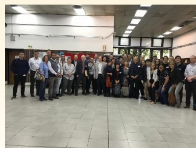
Group photo of participants of the 1 st LAWE.